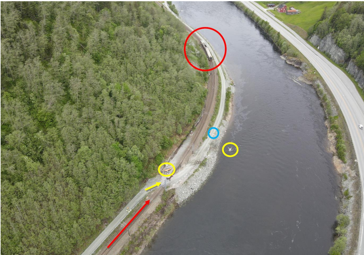
Overview photograph of the accident site. The yellow arrow indicates the tractor's direction of travel. The yellow circles indicate the tractor's position in the river and the trailer's position to the left at the signal box. The blue circle shows where the driver was found. The red circle shows the location of the train after the accident. Graphics: NPRA

Research, reports and observations show that there are many reasons why road users inadvertently make mistakes in these situations and end up in very dangerous situations. The investigation refers to various surveys and observations showing that road users fail to stop for the red stop signal. It is uncertain why this is the case, and the NSIA believes that the road authorities should reach a conclusion in their work on alternatives to stop signals in the event of closed tunnels. The result of this work may also be relevant for level crossings.