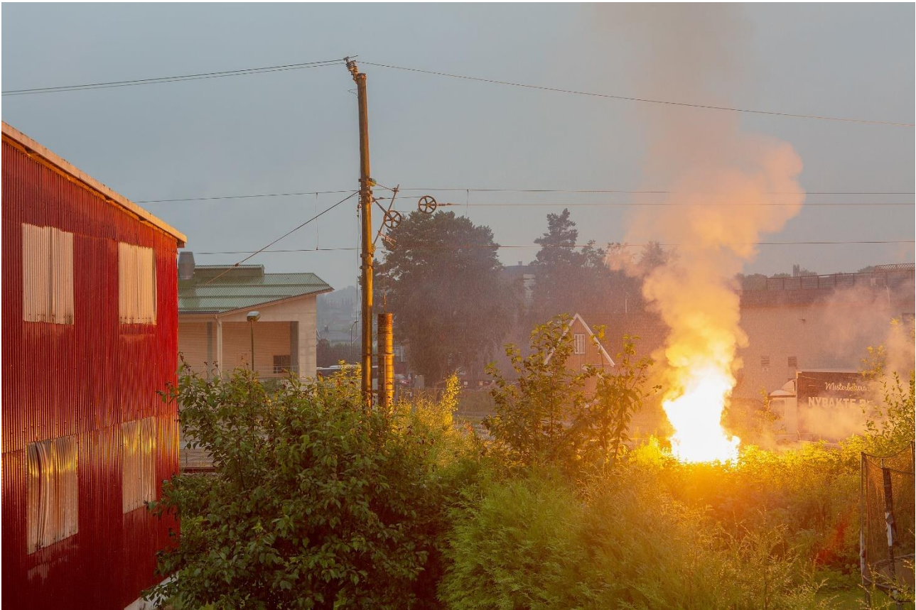
Visible outdoor fire during the short circuit.