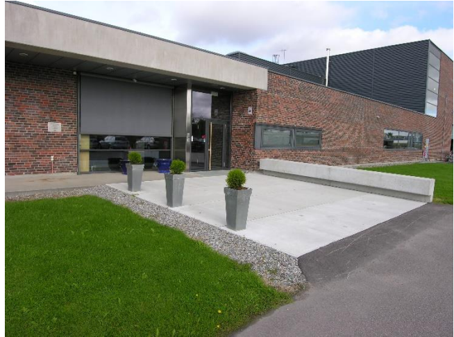
The NSIA is located in Lillestrøm.

The NSIA investigates accidents and serious incidents in the aviation, rail, road, marine and defence sectors. The purpose of the investigations is to elucidate matters deemed to be important for the prevention of accidents in the transport and defence sectors, but it is not the NSIA's task to apportion blame or liability under criminal or civil law. The NSIA decides the scale of the investigations to be conducted and this includes making an assessment of the investigation's expected safety benefits in relation to necessary resources.