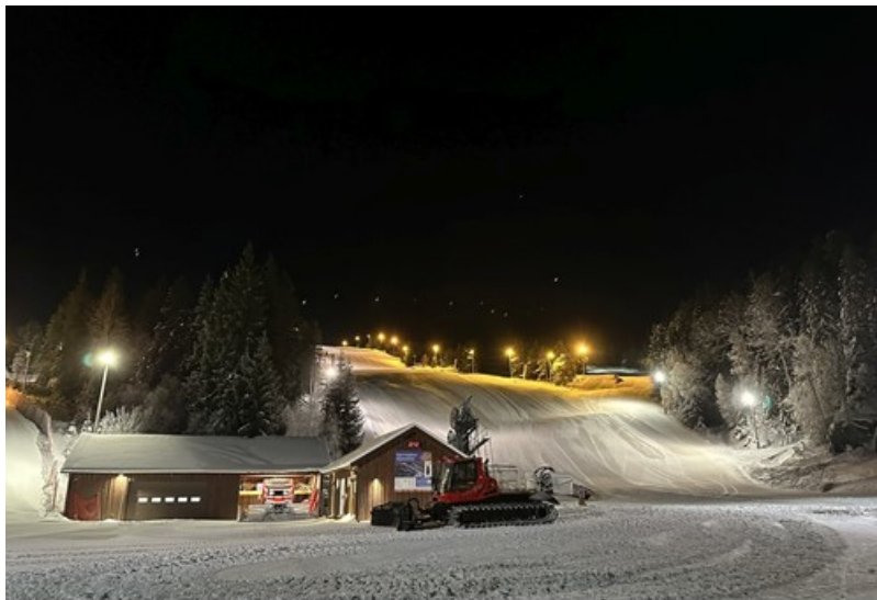
Kjerringåsen alpine centre.

The purpose of the investigation is to contribute to learning that can be used in the work to improve safety when working in ski lifts.