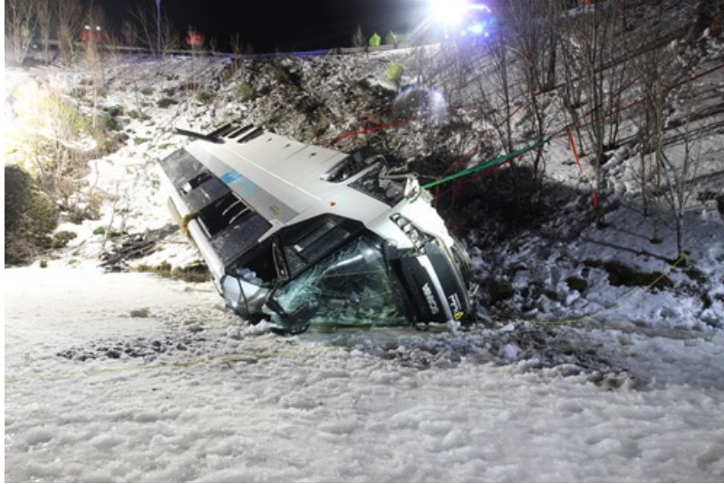
End position of the bus at the accident site on E10, with the right front in Åsvatnet.