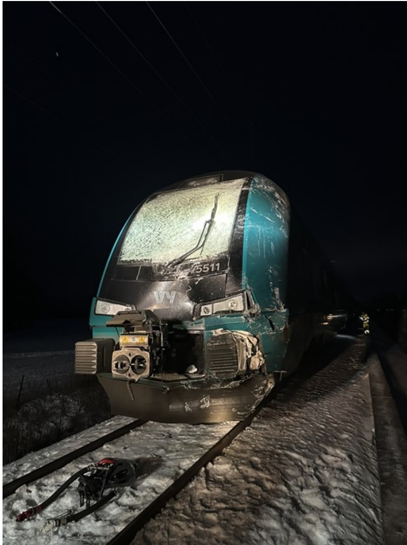
The train after the collision.