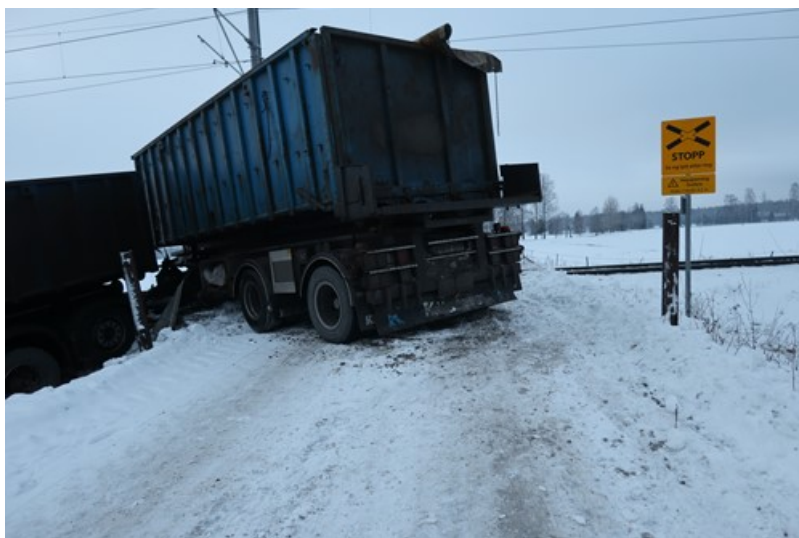
The level crossing.